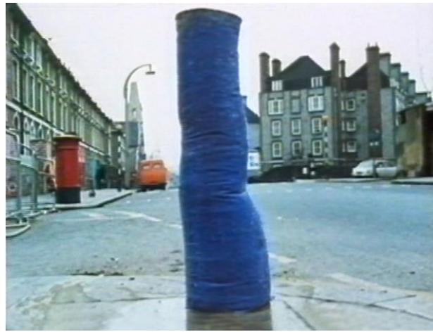
(Clockwise from top left) Barry Flanagan, a hole in the sea , 1969; Barry Flanagan, Untitled , 1968; Barry Flanagan, bollards project , 1970; Barry Flanagan, Pile 1 '67/8 , 1967–1968.